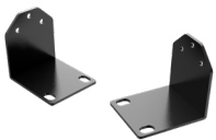
19" rack mount ears